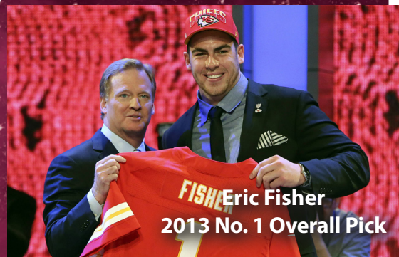
Eric Fisher 2013 No. 1 Overall Pick

Open to any and all entrants • The cost of any awards are included in the cost of attendance. CMU is an AA/EO institution (see www.cmich.edu/aaeo ). For ADA accommodations, call (989) 774-2151 at least one week before the event.